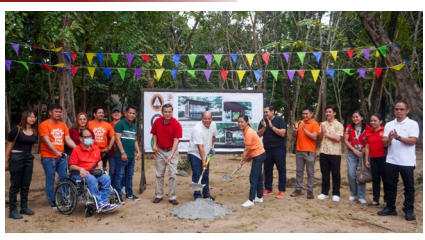
TSU students to benefit from alumni-sponsored solar charging station