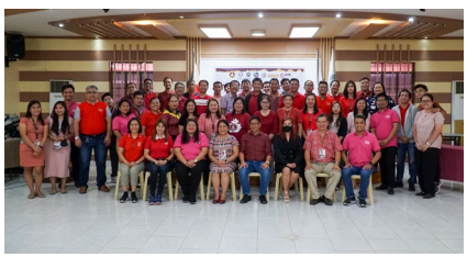
University administration dives into Futures Thinking and Strategic Foresight workshop