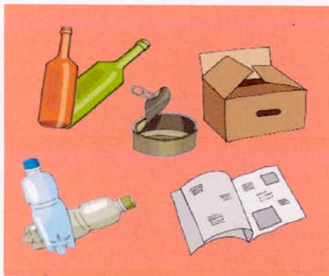
Fig 3. Red Bin (Recyclable)