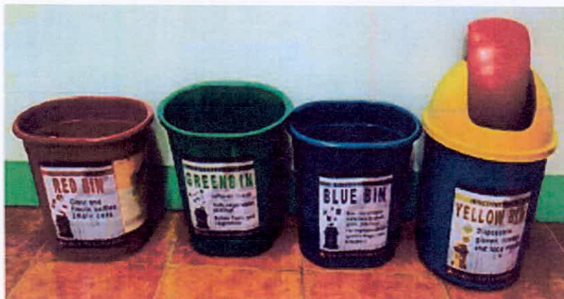
Fig. 6 Office Waste Segregation

e. If four colored bins are NOT available in the office, boxes can be used as bins, below signage may use: