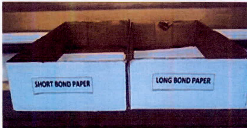
Fig. 8 Segregation for Paper

f. Provide segregation for paper (long/short sizes) that are still possible to be re-used.