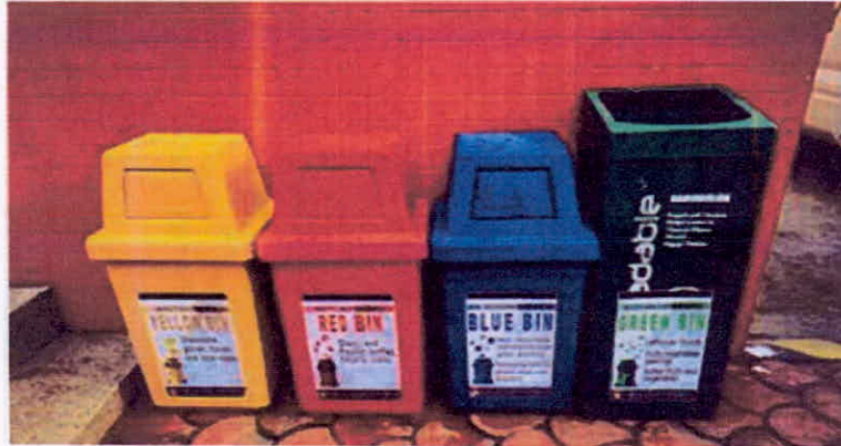
Fig. 5 Standardized Outdoor Wastes Bins