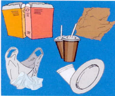
Fig 1. Blue Bin (Non-Biodegradable Waste)

a. Wastes according to types and proper bins