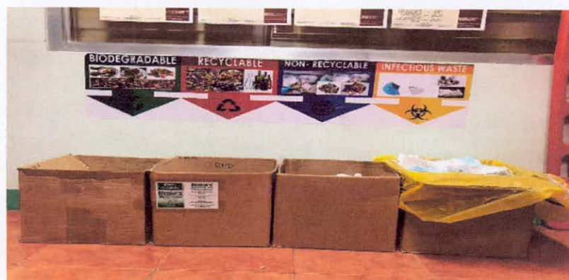
Fig. 7 Signage if four colored bins are not available.

e. If four colored bins are NOT available in the office, boxes can be used as bins, below signage may use: